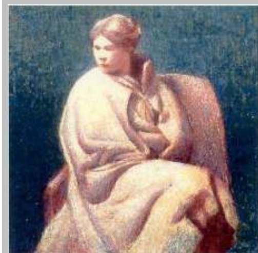
Gertrude Schmitt in Cape 1930 The Epic Plane

Last century when paddlewheel riverboats plied the Mississippi the leadman would often take a depth reading. "Mark Twain" was a frequent call showing that the water was 2 fathoms (12 feet) indicating a safe depth.